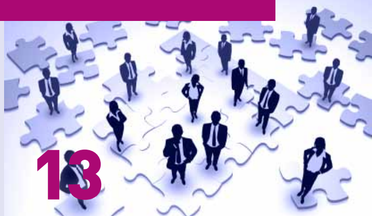
Organizational structure of KELER CCP - December 31. 2010